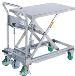
Manual • Stainless Steel