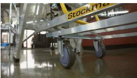
StockMaster Navigator keeps all four feet firmly on the ground unless you're moving it.