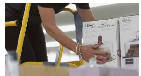
StockMaster Navigator Pro has a safety rail system that can be adjusted for stock picking.

StockMaster Navigator is a modular design enabling parts replacement in the event of accidental damage. It is manufactured from high quality materials and built to last. With reasonable care StockMaster Navigator will give many years of service, and cost less in the long run.