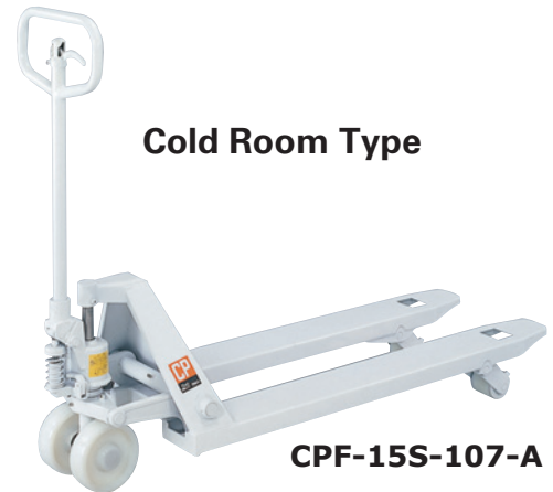
Cold Room Type