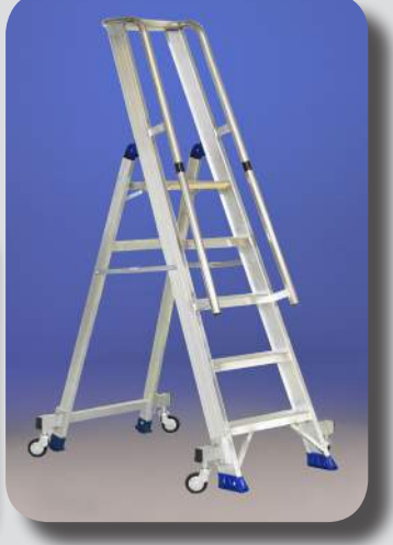
Regina Vip 4 WD