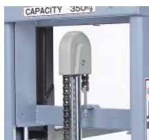
Sprocket cover Clean, lightweight resin cover.